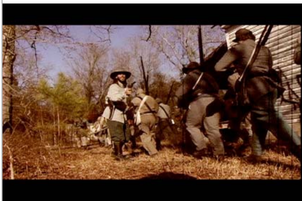
Captain Hornblower conducts a strategic retreat